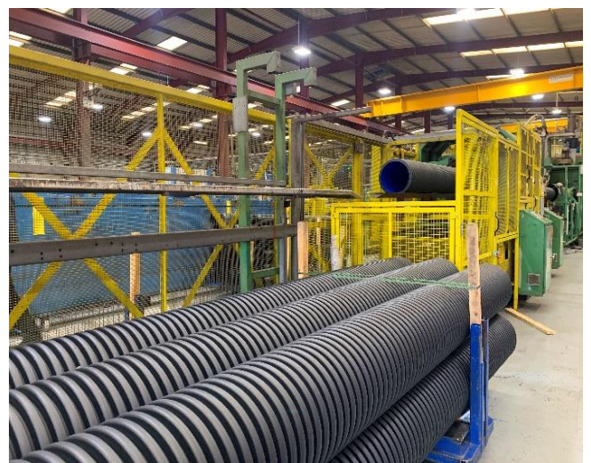
Polypipe's Plastic Drainage Pipes

From Mechanical and Electrical Engineers to experts in Maintenance Engineering, Polypipe now employs over 1000 employees and their Horncastle site is Horncastle's biggest employer with a workforce of over 310 staff!